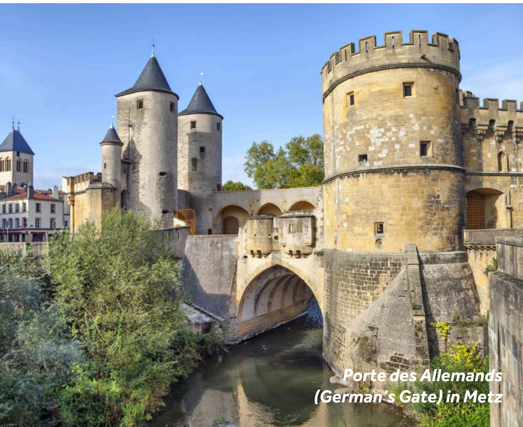
Porte des Allemands (German's Gate) in Metz