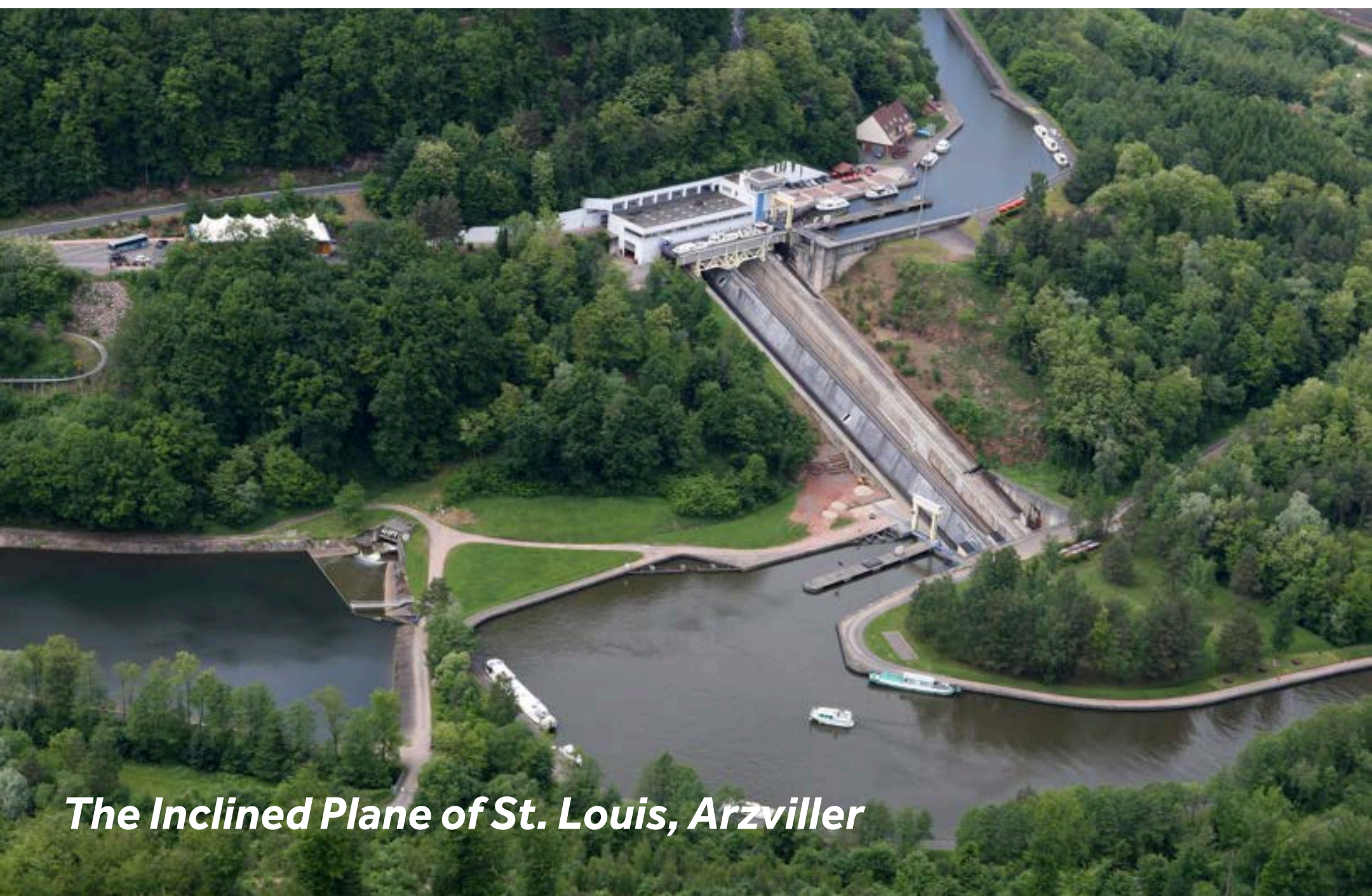
The Inclined Plane of St. Louis, Arzviller

More accurately known as the 'Inclined Plane of St. Louis', there is nothing else like it in Europe. It came into service in 1969 and replaced a chain of 17 locks, which took an entire day to pass through. Nowadays, the ascent of 44.5m is traversed in just four minutes. Guided tours are possible, which include the machine-room, led by qualified guides who provide a full explanation of how the lift works. A little train can also take you upstream to explore the beautiful "Valley of the Lock-keepers" to experience the early days of navigation. On the road from the top to the bottom of the lift, kids (and big kids) can whoosh through the trees on the 500m luge track. And at the bottom of the road, Cristal Lehrer is an amazing shop offering hand-made and mouth-blown crystal glasses, vases, decorations, jewels and more - a beautiful souvenir from the 'Crystal Valley' to bring home for your family or friends!