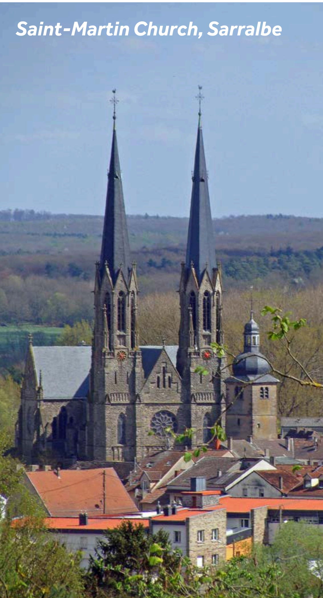
Saint-Martin Church, Sarralbe

Sarralbe is situated at the point where the river Albe flows into the Sarre, which is how its name came about. The canal crosses the river Albe on a bridge built in 1867, which was the first metal bridge of its kind to be constructed in France. The architecture of the village is quite modern as many buildings were destroyed during WWI & WWII. However, Saint-Martin Church, also known as 'Cathedrale of the Sarre', remains and is worth a visit, as are the fortifications and the 'Albe Town Gate' from 14th Century.