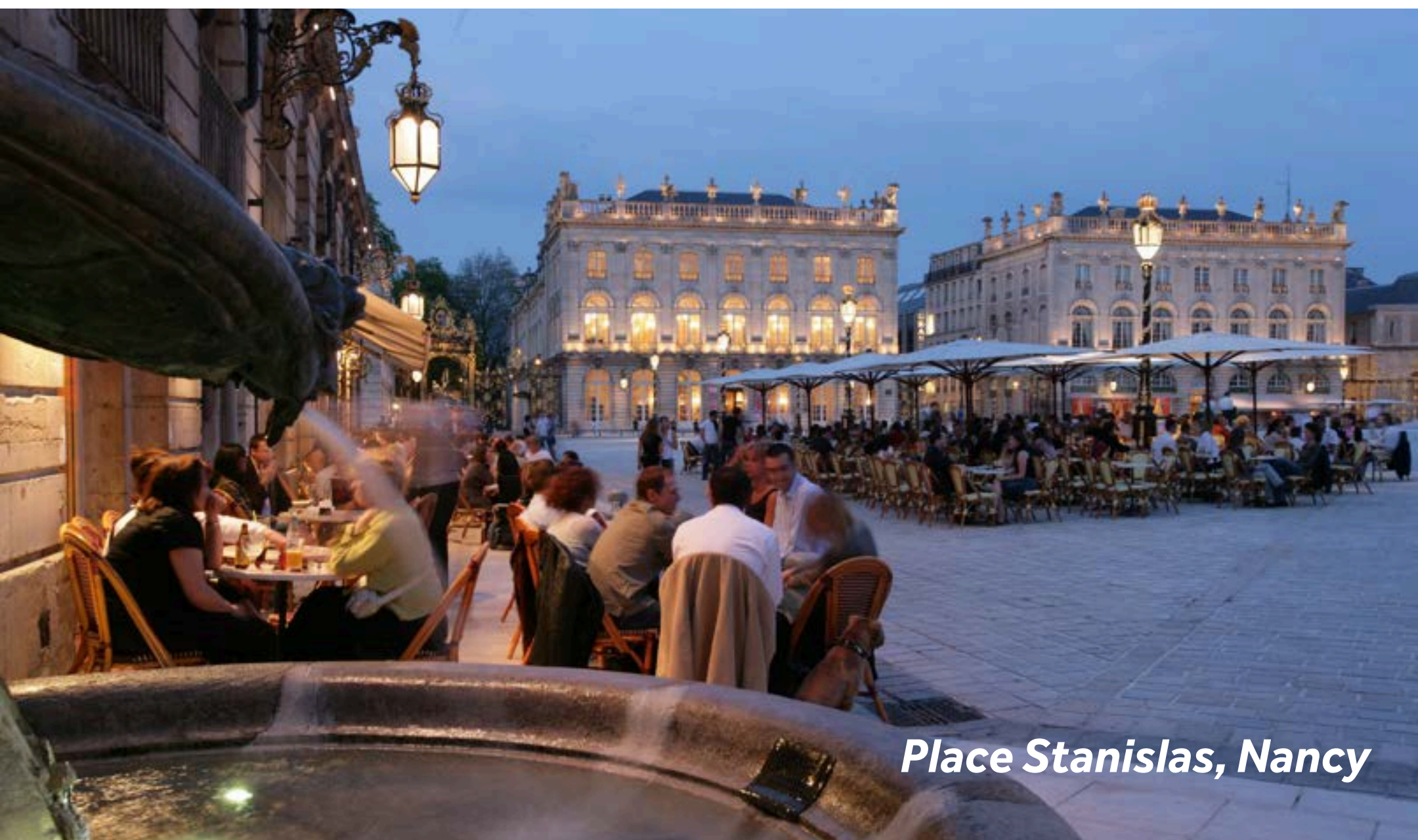
Place Stanislas, Nancy