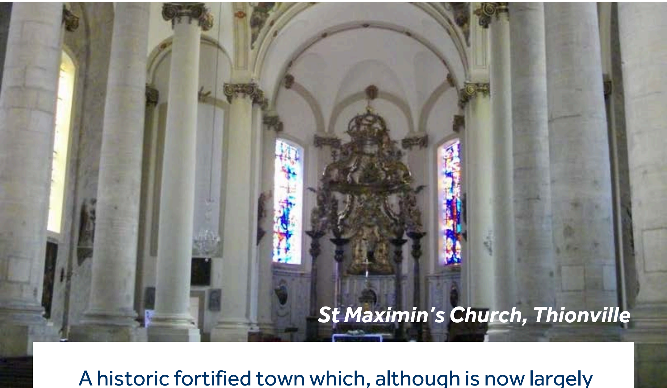
St Maximin's Church, Thionville

A historic fortified town which, although is now largely industrialised, possesses some interesting sites worth visiting. The immense and sturdy St Maximin's Church contains some very large organs, the cases of which are brimming with decorative detail. Further along the riverside, the 12th/13th century Tower of Puces is a complex fourteen-sided building which now houses the Thionville Regional Museum and charts the history of the area, from the Palaeolithic to the Late Middle Ages, including the countless sieges the town has endured over the centuries. Slightly outside of town, you can visit Guentrange Fort, fortifications built by the German army before WWI when this region was a part of Germany.