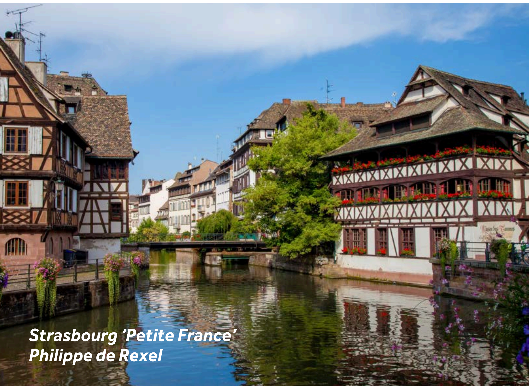
Strasbourg 'Petite France'