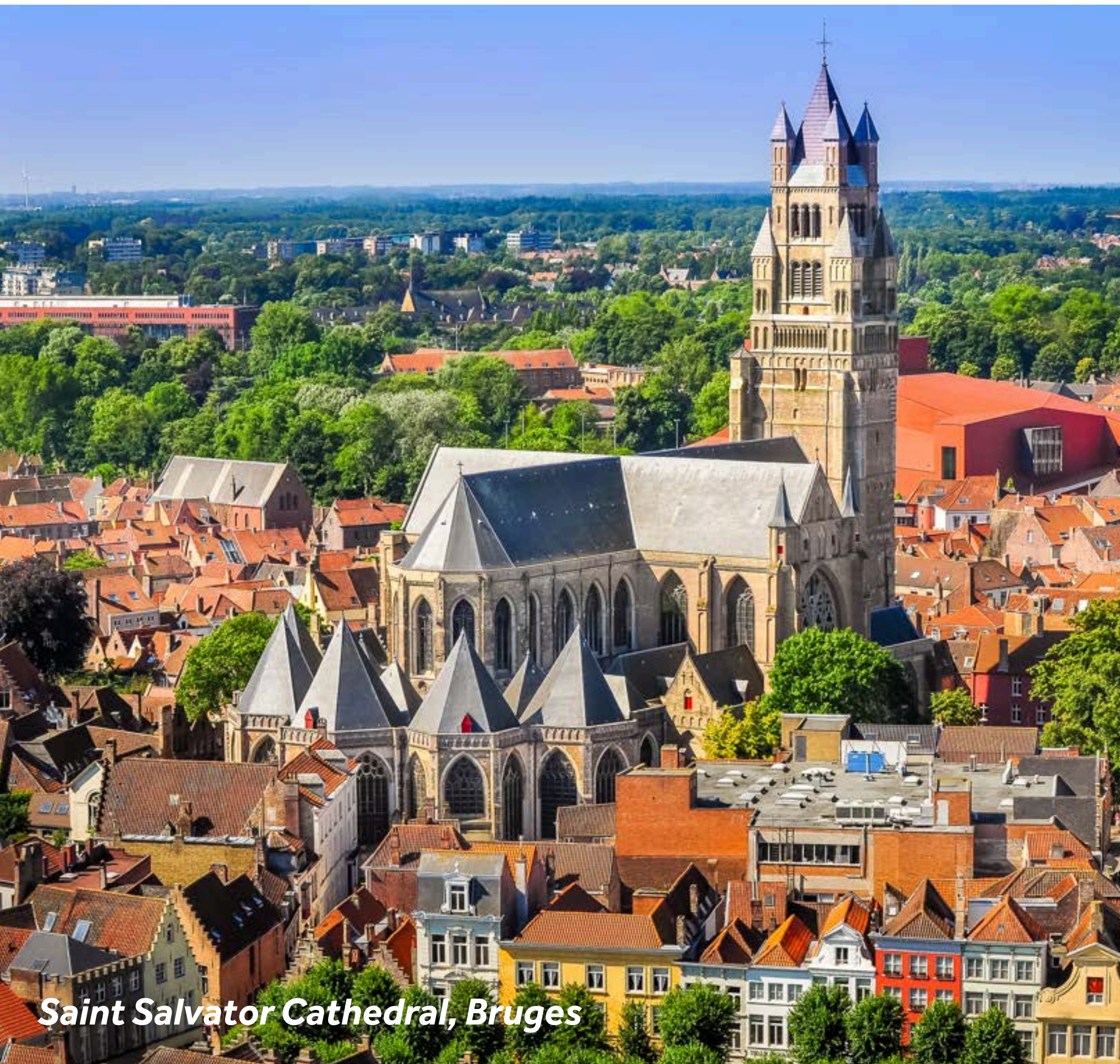
Saint Salvator Cathedral, Bruges

The De Halve Maan Brewery is a must-see, and why not top off an action-packed day (or two) by climbing the Belfort for stunning views across this awe-inspiring city?