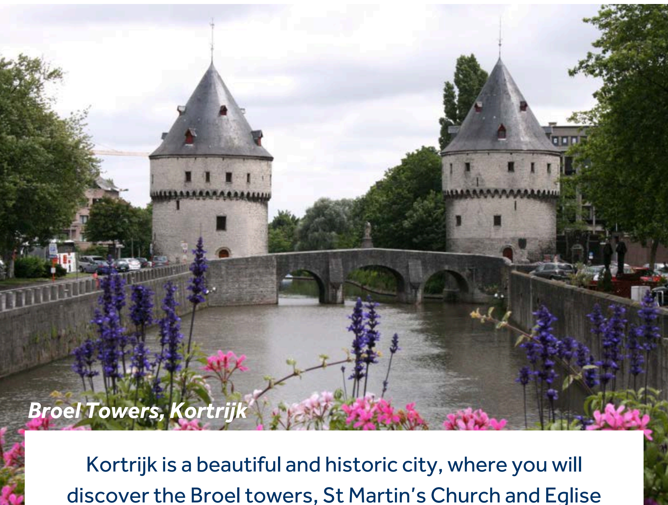
Broel Towers, Kortrijk

Kortrijk is a beautiful and historic city, where you will discover the Broel towers, St Martin's Church and Eglise Notre-Dame – among many other buildings that make up this town's magnificent local architecture. Why not discover these sites on the 'Metamorphosis of the city' walk, by following the 4.3km route that is marked by metal rivets in the ground. Start at the Tourism office and you can also download an audio guide to guide you along the way.