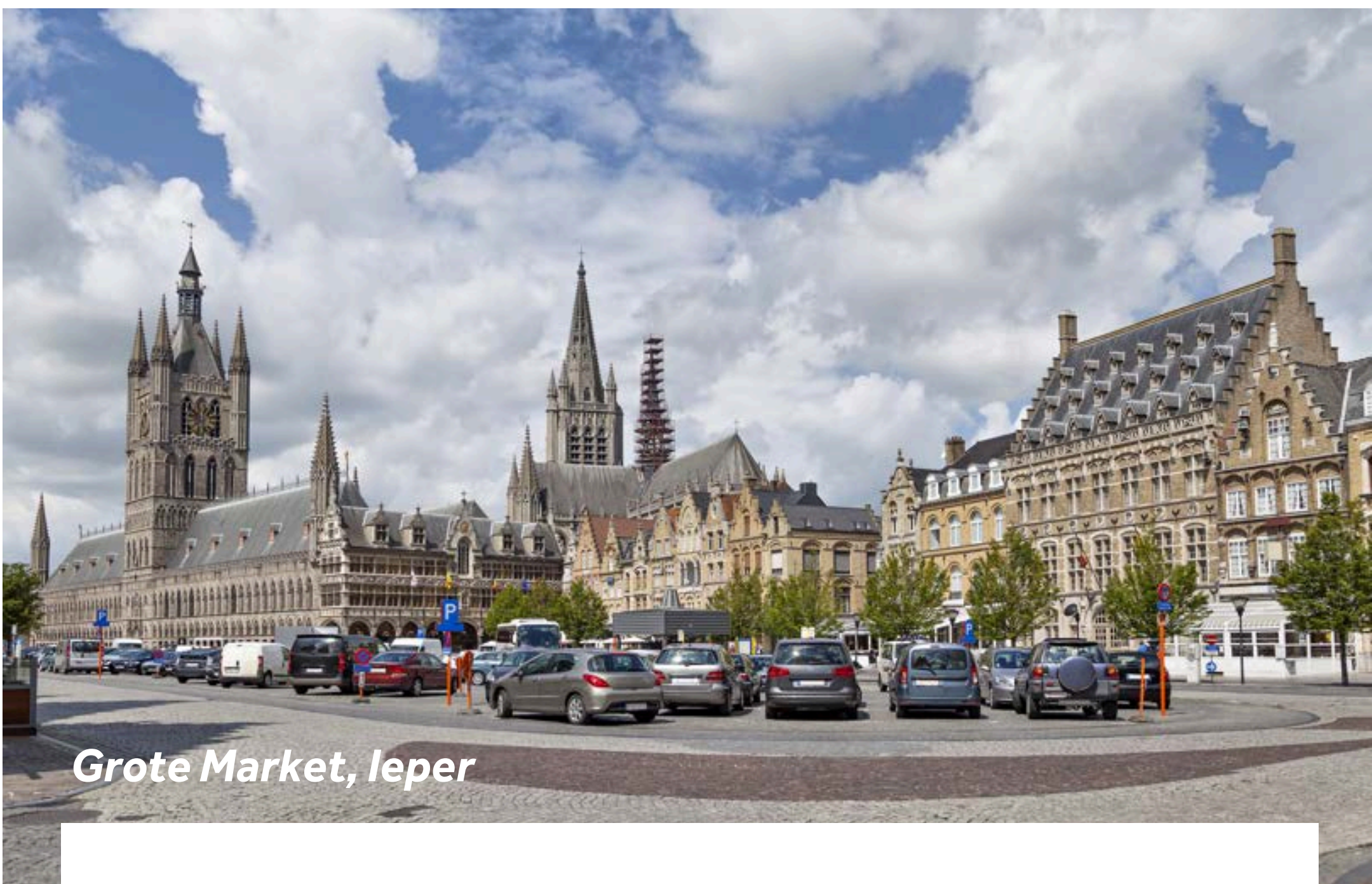
Grote Markt, Ieper

Ieper (commonly known by its French name, Ypres) is a beautiful and welcoming city full of history. Like most Belgium towns, the central market square is the hub of activity with beautiful architecture, restaurants and attractions, including the stunning 'Cloth Hall' (home to the excellent Flanders Fields Museum) and 70m belfry. If you wish to pay tribute to the fallen, head down Menenstraat (off the square) to the Menin Gate Memorial, a fitting place to reflect and remember. For some light relief, the rollercoasters and thrills of Bellewaerde Park are 4.5km east of the town.