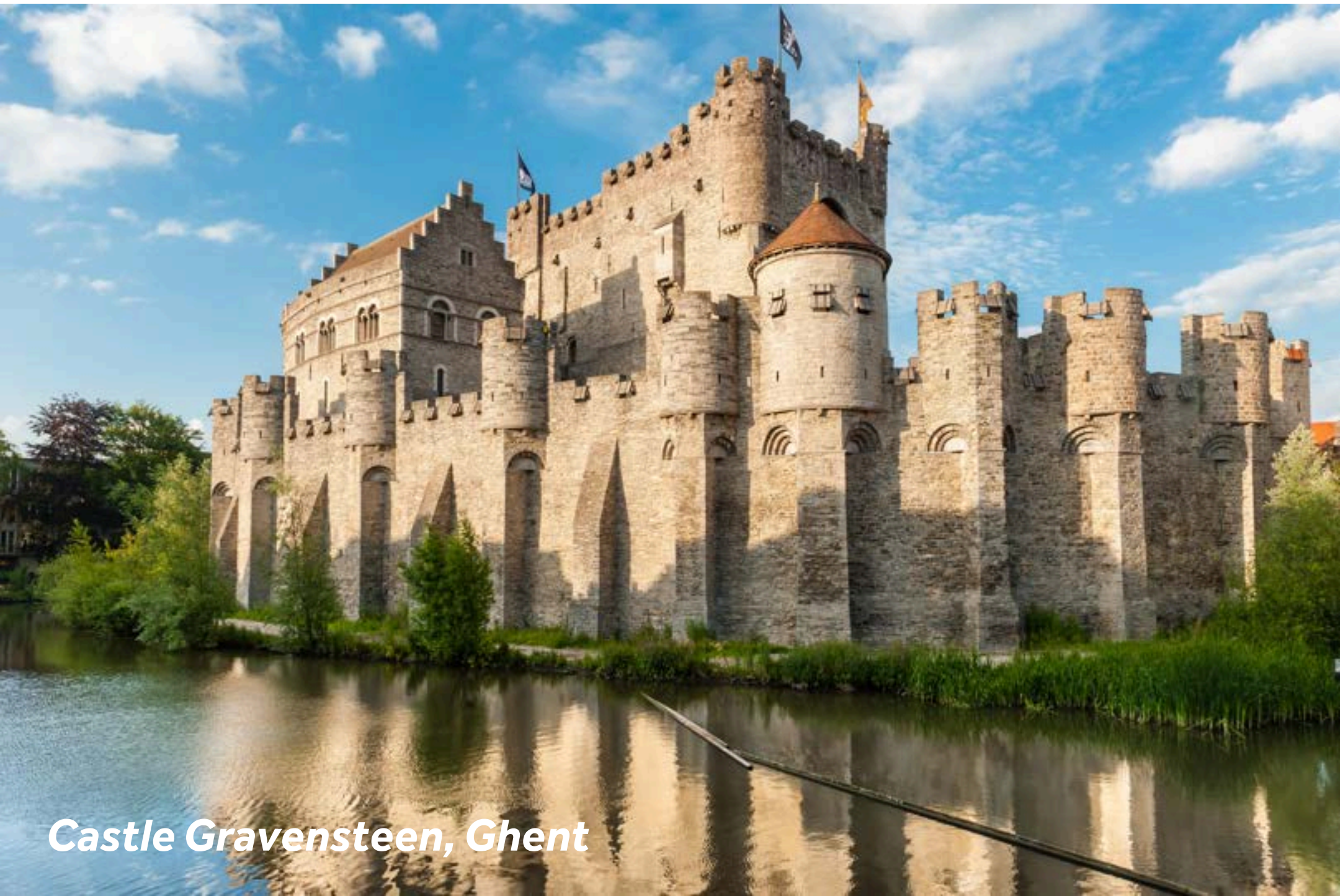
Castle Gravensteen, Ghent

Ghent, the pearl of Flanders, was once the largest city in Europe after Paris. No other city in Belgium has as many monuments and important buildings; St Michael's Bridge, St. Bavo's Cathedral, Gravensteen Castle, the Belfry and Cloth Hall to name but a few. The historic centre is ideal to explore on foot - bring your camera - with fascinating museums, quirky bars and stunning architecture, Ghent is a city you won't want to miss!