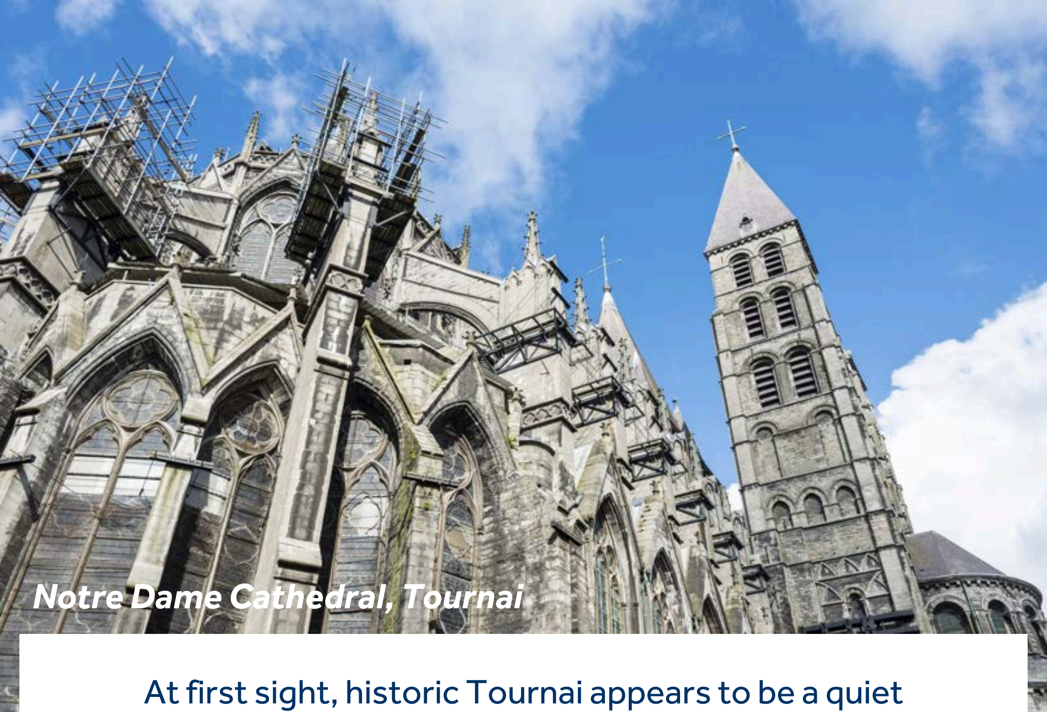
Notre Dame Cathedral, Tournai

At first sight, historic Tournai appears to be a quiet provincial town, but there is a lively buzz and lots to see and do. The Cathedral of Our Lady of Tournai (Notre-Dame Cathedral) is one of the most spectacular churches in Belgium and is a UNESCO World Heritage site. Sadly, it is undergoing extensive restoration so much of the outside is masked by scaffolding and parts of the interior are inaccessible. However, there's still enough to see to make a visit worthwhile and the treasury room is not to be missed.