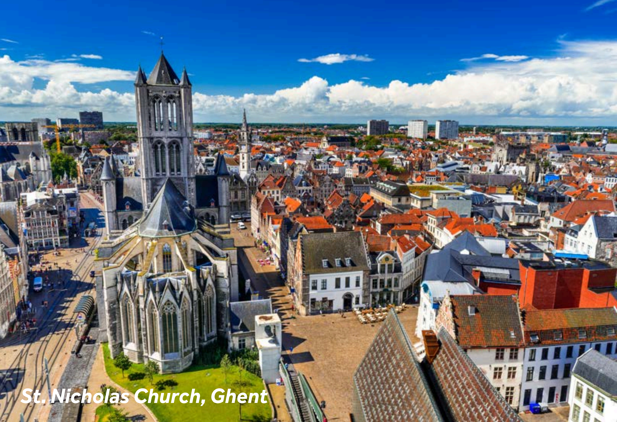
St. Nicholas Church, Ghent