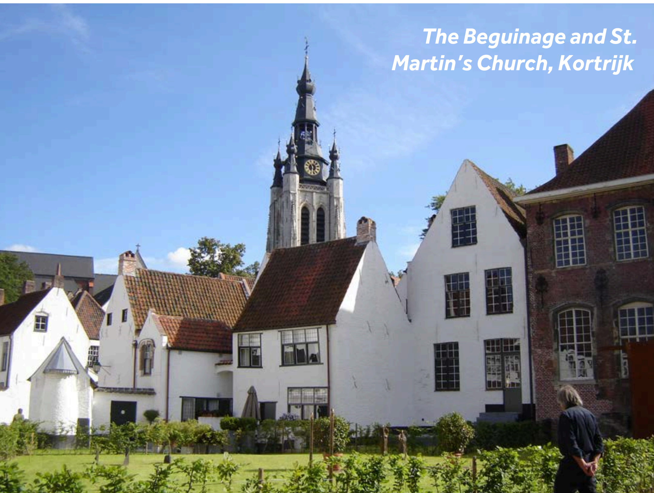
The Beguinage and St. Martin's Church, Kortrijk

Visit 'Texture' to learn about the textile, flax – its production has brought much wealth to Kortrijk. Right in the city centre you will discover the tranquil haven of a beguinage, a complex which once housed religious women. This is one of many in Belgium that has been listed as a UNESCO World Heritage Site. There is a very informative museum on site.