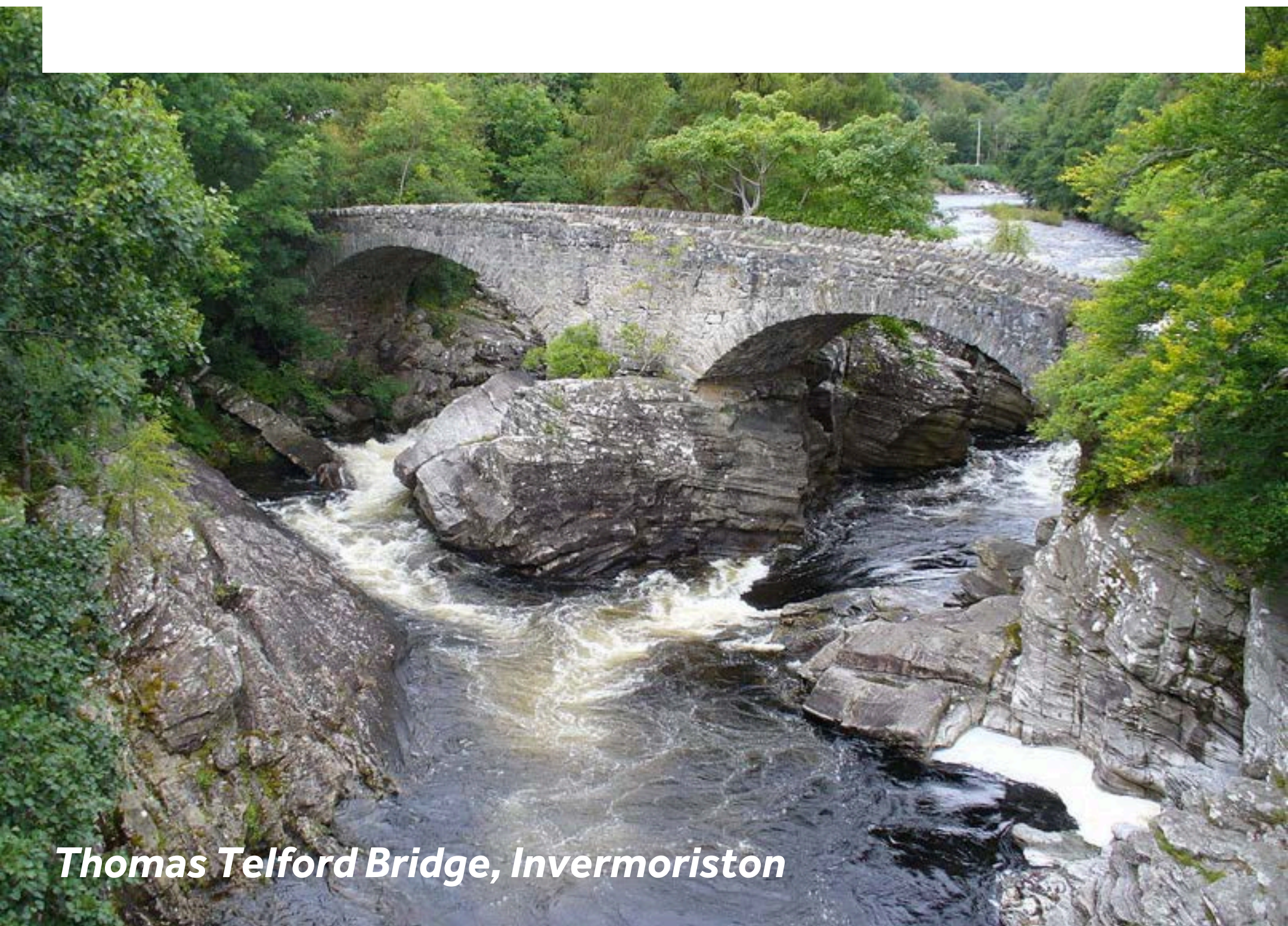
Thomas Telford Bridge, Invermoriston

A 10 minute bus ride away is Invermoriston. It is located on the shores of Loch Ness, but there are no moorings to access the village by boat. The town bridge, built by renowned engineer Thomas Telford in 1813, is the star of this pretty village. Take a short busride to see it for yourself. St Columba's Well is said to have been blessed by the Irish Saint in AD565, and was believed by locals to have healing properties and small offerings are left beside the spring in gratitude. The Clog & Craft Shop is the perfect place to pick up some souvenirs.