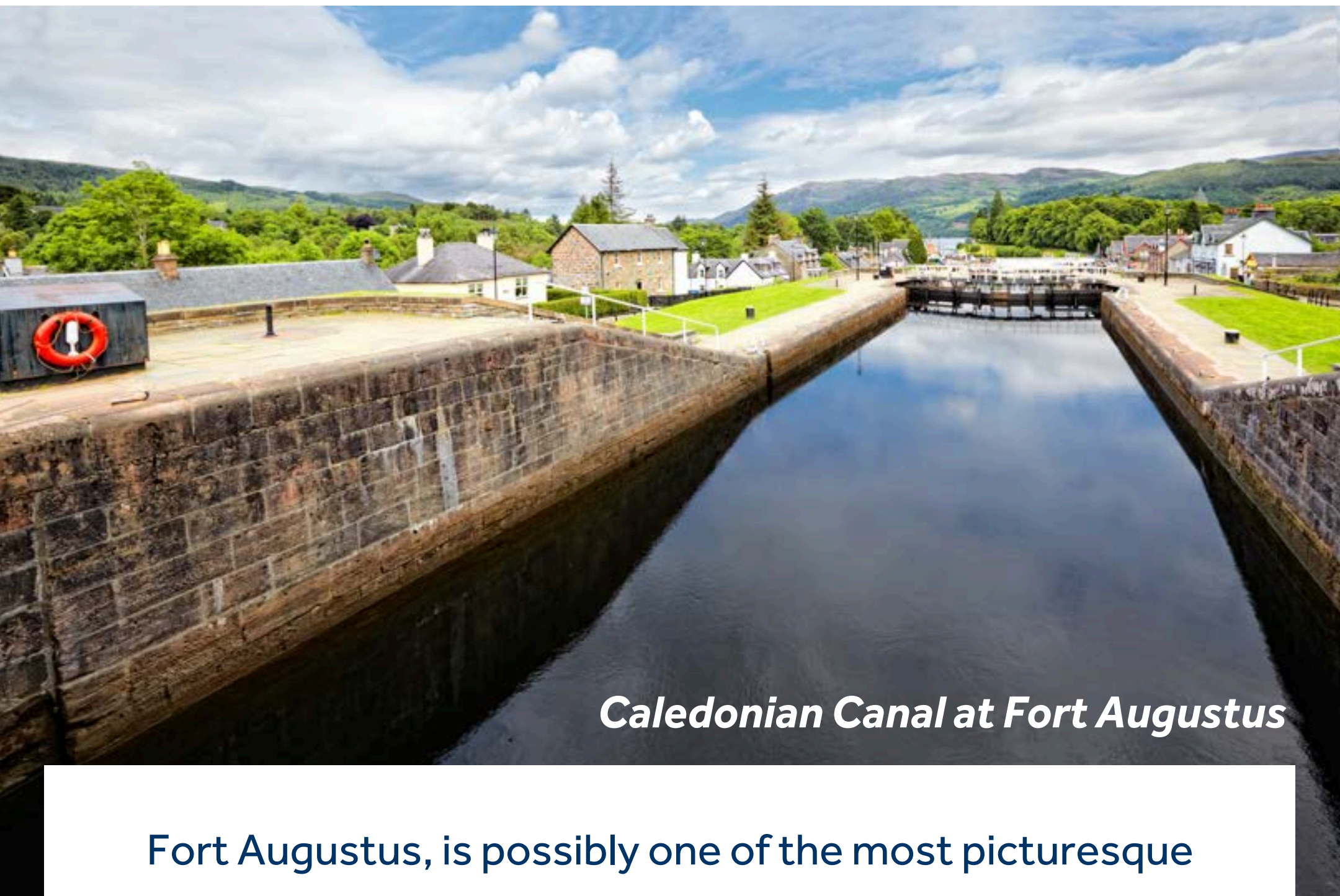
Caledonian Canal at Fort Augustus

Fort Augustus, is possibly one of the most picturesque towns along the canal and there is plenty to do here. The flight of five locks, at its southern approach, takes about one hour to negotiate, so ensure you allow plenty of time and arrive well in advance. Near the bottom of the flight of locks, pop into Iceberg Glass for some great souvenirs and you can also watch them being made. The Caledonian Canal Heritage Centre is a great stop if you want to learn more about the history of this 200 year old canal, while The Clansman Centre is one of the most unique attractions in Fort Augustus. Here you'll experience live demonstrations by actors in traditional highland dress and gain an insight into what life was like in 18th century Scotland. They also have a great Celtic craft shop. The town is a haven for walkers and cyclists with many trails around the area, the most popular being the Great Glen Way.