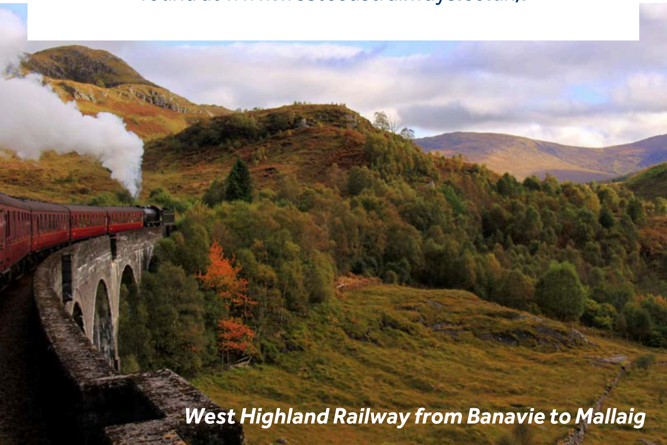
West Highland Railway from Banavie to Mallaig

Harry Potter fans will love the Jacobite steam train, used as the Hogwarts Express in the film series. It runs along the West Highlands Railway to Mallaig and back, taking in breath taking scenery on an 135km round trip. It is advisable to book in advance though – this service can get very busy during the season! For an alternative option, book the same journey on the diesel train which starts its route at Bavanie (more information can be found at www.westcoastrailways.co.uk ).