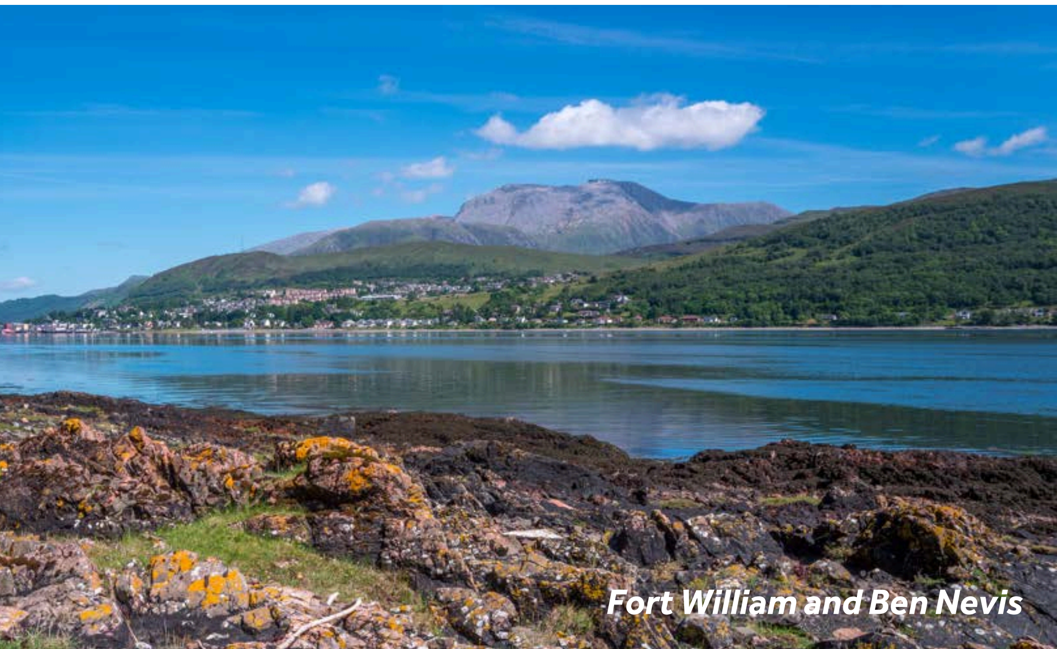
Fort William and Ben Nevis

A 10 minute bus journey from Banavie is Fort William, buses run every 15 minutes during the day. Renowned as the outdoor capital of the UK, Fort William offers all the outdoor activities you could dream of, starting with the tallest mountain in the UK – Ben Nevis. If the thought of walking up is too daunting (recommended for fit and active walkers only – appropriate clothing and footwear is essential), you can take a gondola up nearby Aonach Mor, the 8th highest mountain in Britain, in just under 15 minutes. From there you'll experience breathtaking views of Ben Nevis, the Great Glen and the surrounding Scottish Highlands. The operators of the gondola, the Nevis Range, offer many other activities too, including a high wire tree top course, a 40m 'Zoom Trax' slide, paragliding, forest walks and mountain biking – to name but a few.