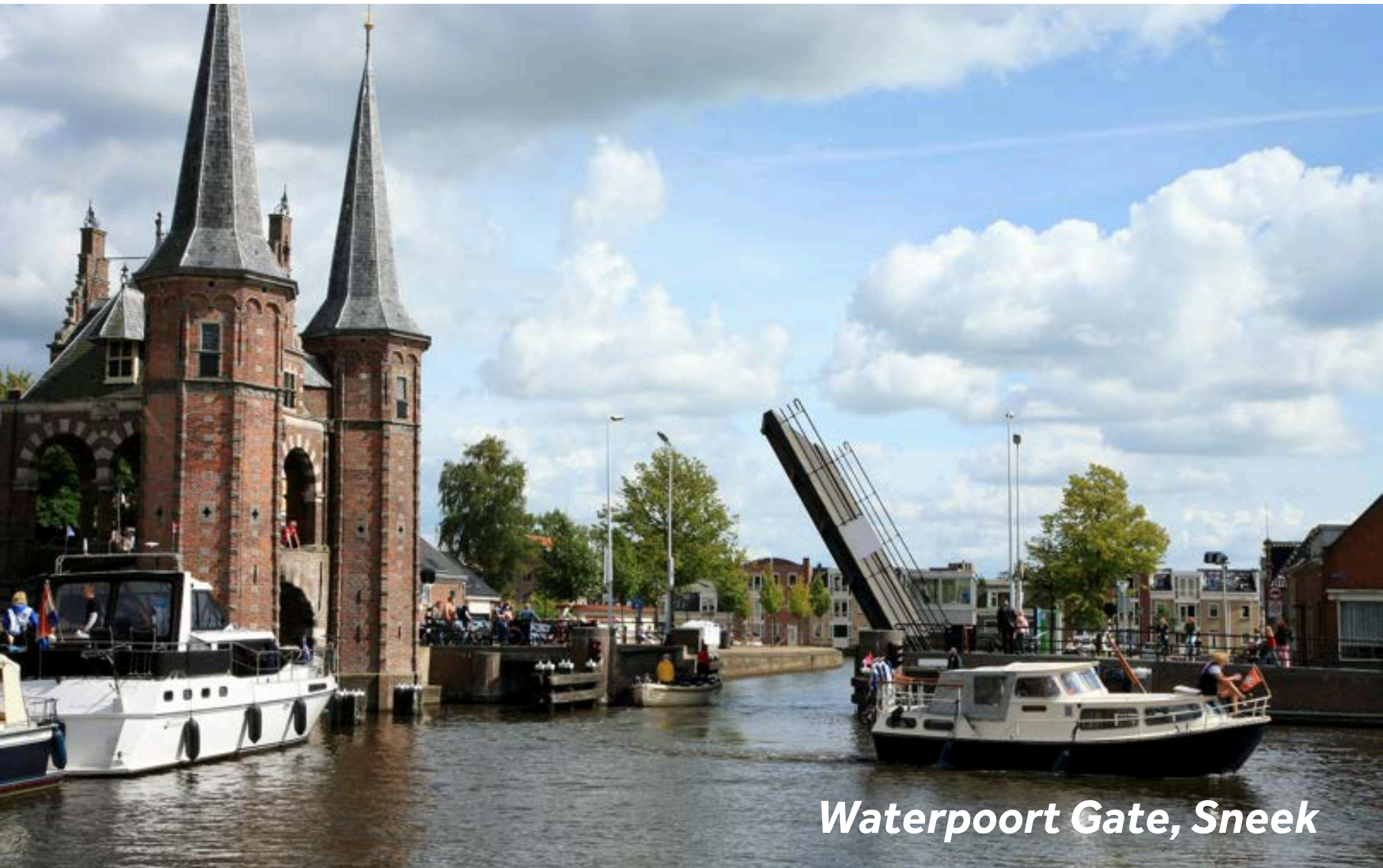
Waterpoort Gate, Sneek

The boating capital of Friesland, Sneek's reputation comes from its week-long regatta, held each August. The town's centrepiece is the beautiful Waterpoort Gate, the only of its kind in the Netherlands and all that remains of the 17th century town walls. The National Maritime Museum offers an insight into the town's nautical past, while the Model Train Museum boasts thousands of engines and carriages. The town is also known for its regional speciality, Beerenburg, a herb-flavoured gin produced across the Netherlands, which you can buy at the Weduwe Joustra shop.