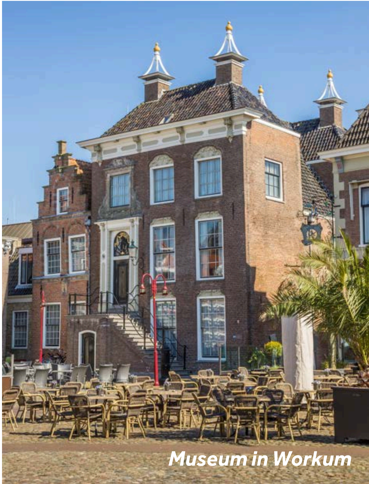
Museum in Workum

Jopie Huisman is a fantastic artist who views the common everyday things in a magical way, reproducing this magic in his art. His life story is explained alongside his paintings in a great little Museum in Workum's bustling main street, which also has a fine church and excellent places to eat and drink.