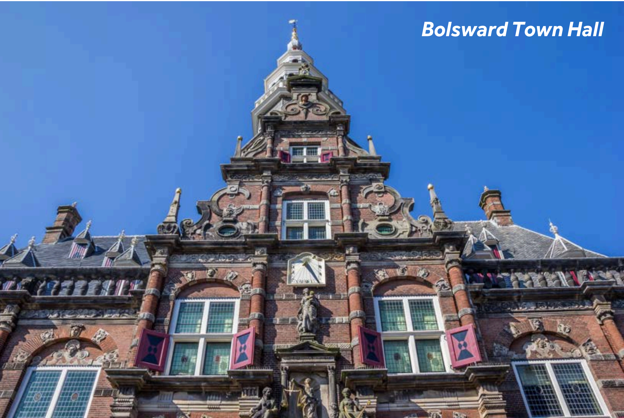
Bolsward Town Hall

The rich history of Bolsward city can be admired through its dozens of national monuments such as the 17th century Bolsward Town Hall, a magnificent red-brick building, or the 15th century Martinikerk, the church, which is home to intricate wooden carvings and pulpit carved from a single oak tree. A ten-minute walk from the town centre is one of the country's smallest breweries, producing 'US Heit' beers and several whiskies. Be sure to catch a tour (Thu to Sat – reserve online www.usheit.com ).