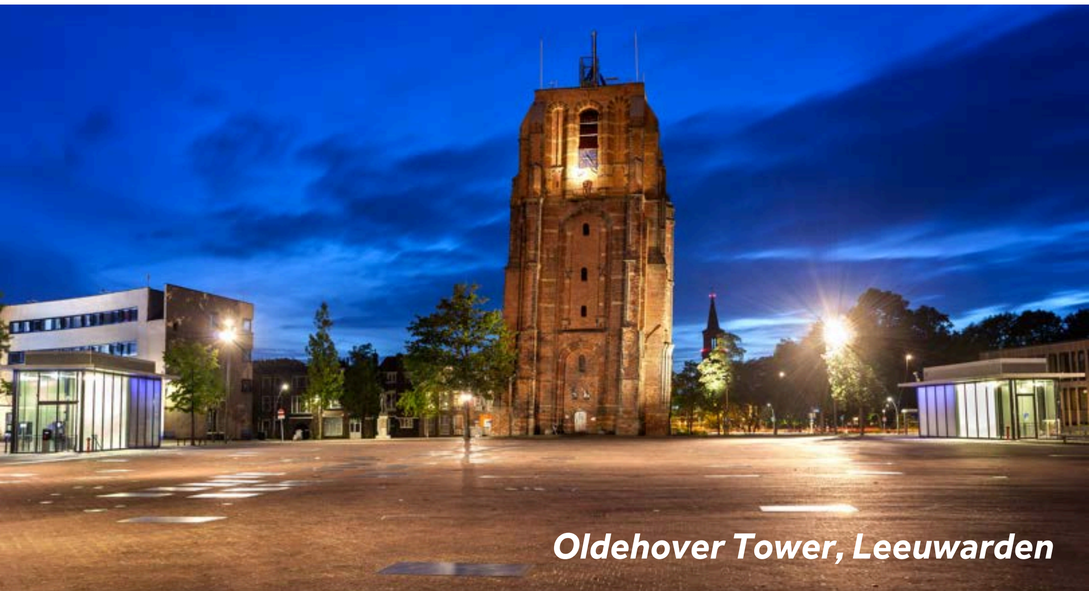
Oldehover Tower, Leeuwarden

As the capital of Friesland, there are plenty of things to see and do in Leeuwarden. The Nature Museum is located in a 17th century building and is dedicated to exhibitions around the local nature and wildlife. Friesland's breed of cattle is renowned across the world, and the Friday cattle market and annual show are still held regularly. The Oldehover Tower (which leans even more precariously than the Tower of Pisa) offers uninterrupted views of the local countryside, once you climb its 183 steps.