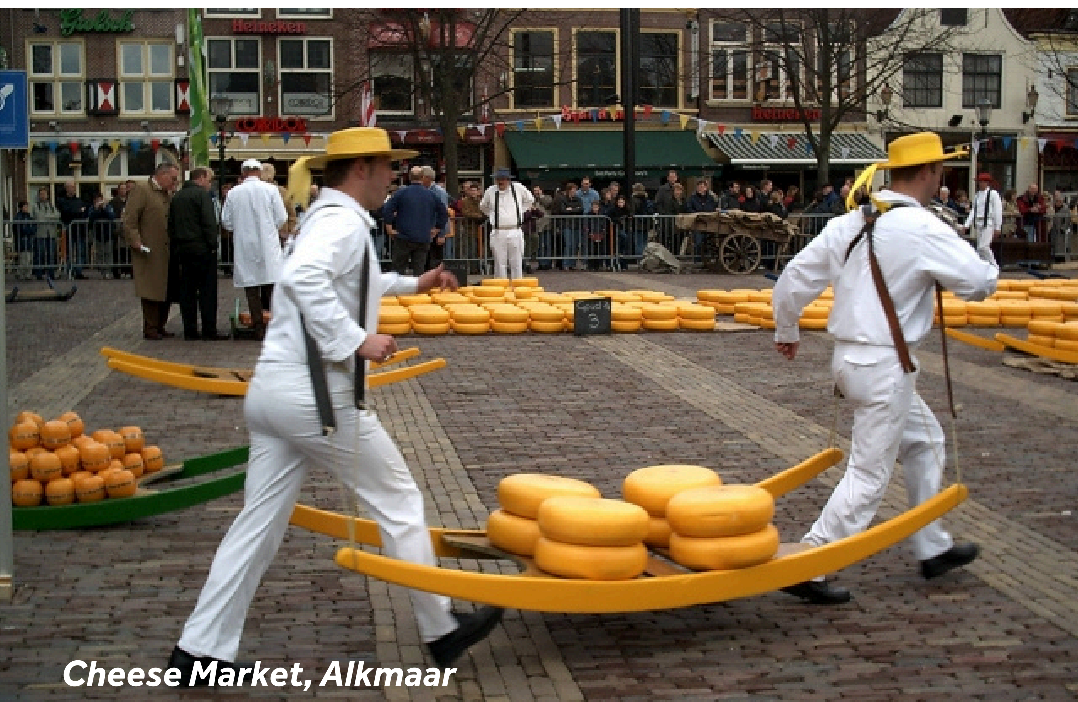
Cheese Market, Alkmaar

Alkmaar also offers breathtaking views and fresh coastal air which can be enjoyed on foot or by bike.