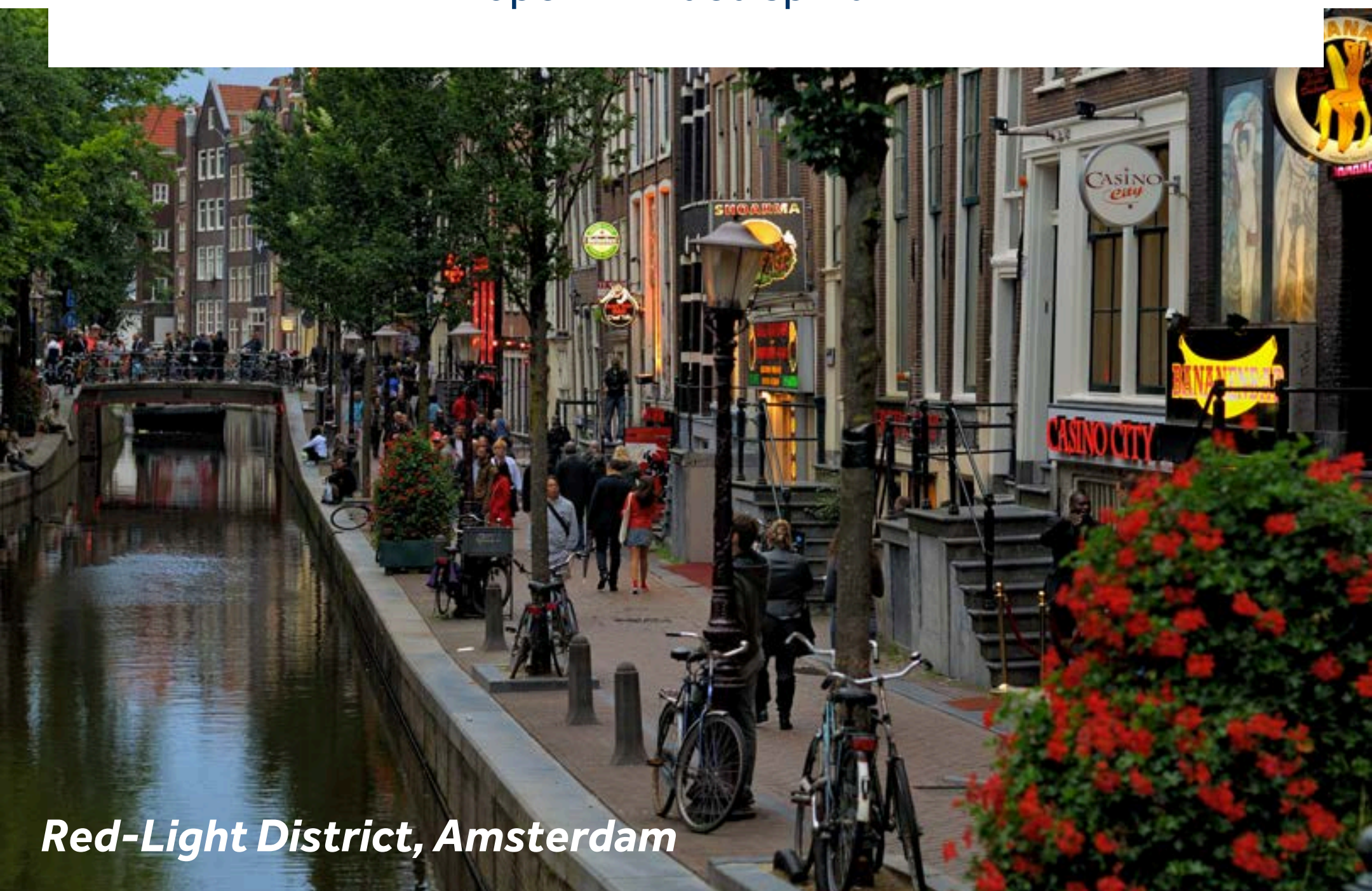
Red-Light District, Amsterdam

Amsterdam's central Red Light District is the most famous of the city's three and draws visitors with its unique blend of history and nightlife. Along its scenic canals, you'll find a mix of bars, adult shops, museums, and historic landmarks, all offering a unique window into Amsterdam's open-minded spirit.