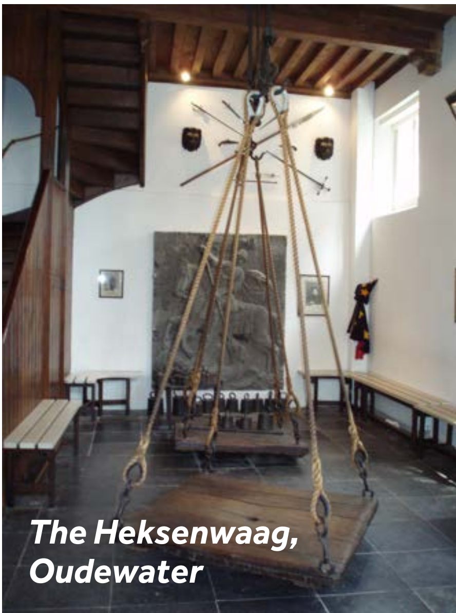
The Heksenwaag, Oudewater

Oudewater is one of the oldest towns of the Netherlands with around 250 protected buildings in the town. While there are a few small boutiques and restaurants, the main attraction here is The Heksenwaag, where witches were tried in the 16th century.