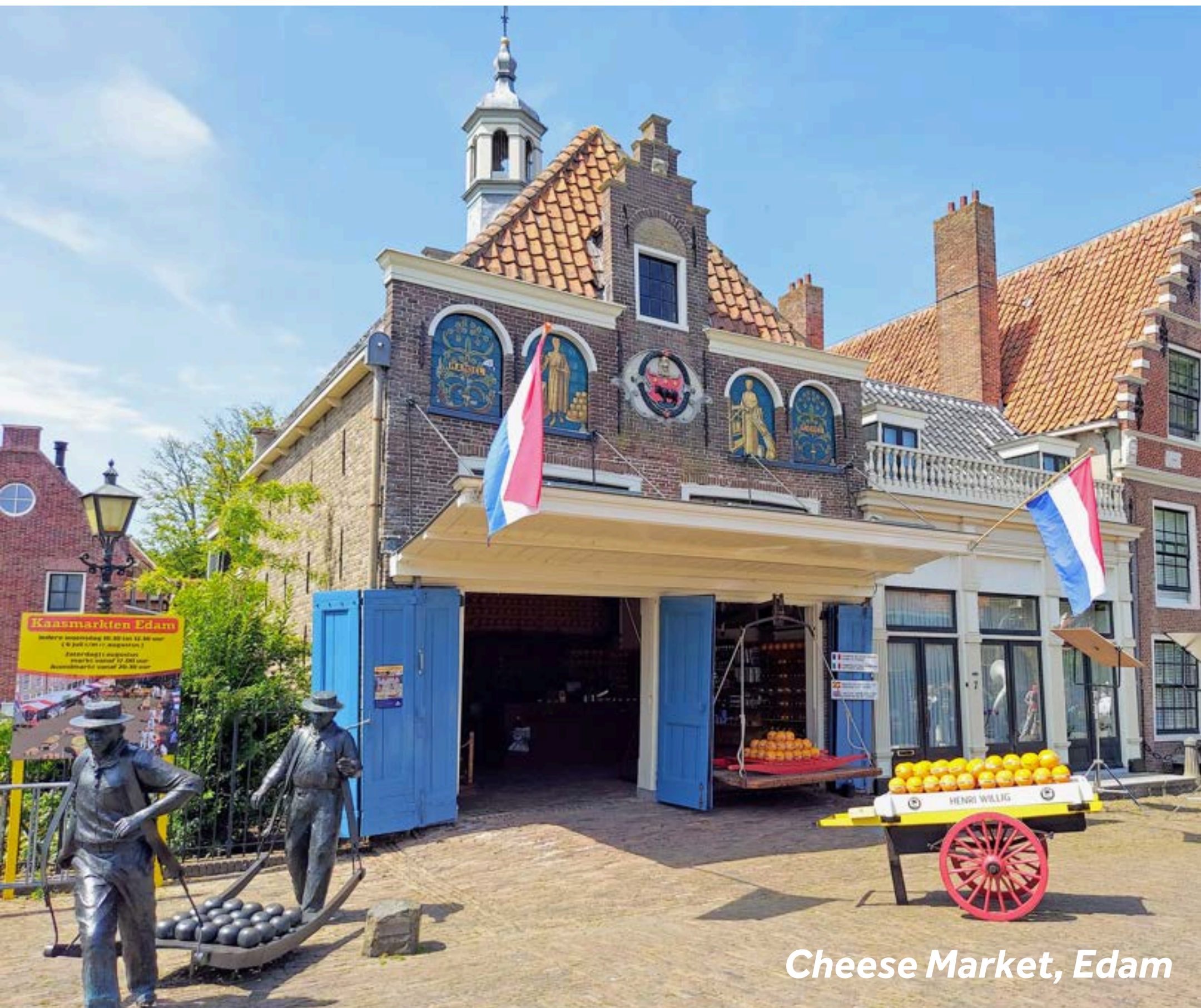
Cheese Market, Edam

Famed worldwide for its delicious cheese, the charming town of Edam celebrates its heritage loud and proud. At the heart of Edam is the Damplein, a small town square where you'll find the Edam Museum, renowned for its floating cellar. From here it's just a short walk to the Grote Kerk, the largest three-ridged church in Europe, where you can enjoy impressive views over the surrounding area. If you're visiting in summer, make sure to visit the Edam Cheese Market, which takes place every Wednesday in July and August. To round out your visit, explore The Story of Edam Cheese, the cheese museum in Edam, where you can learn about the town's cheese-making history and enjoy a guided tour and tasting. Make a booking on tickets.thestoryofedamcheese.com .