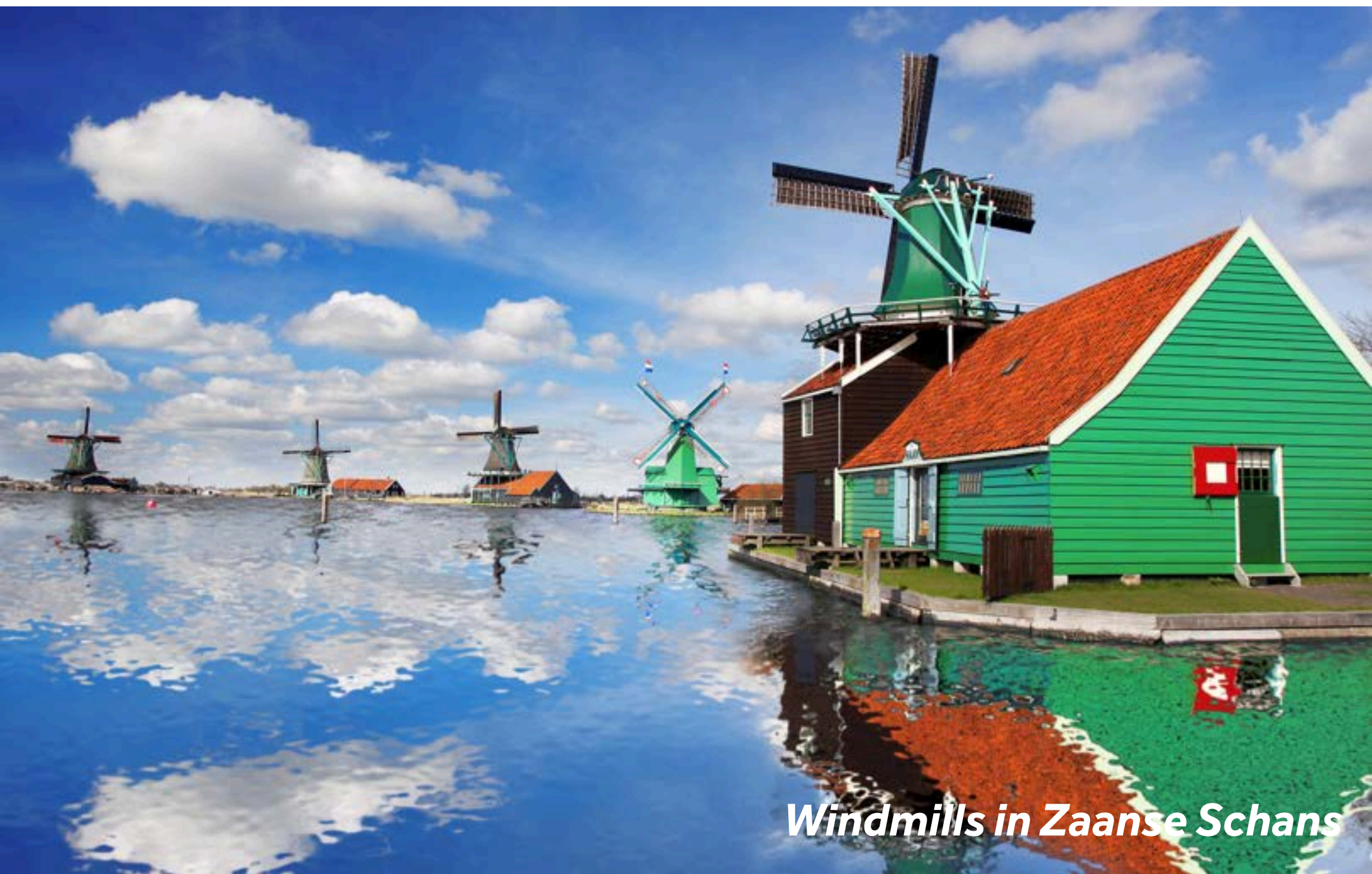
Windmills in Zaanse Schans

Take a step into a storybook when you stop at Zaanse Schans, a charming Dutch village famed for its 13 iconic windmills. Along the scenic Kalverringdijk, visitors can explore historic mills like De Huisman, De Kat, and De Zoeker – each showcasing traditional Dutch craftsmanship. Nearby, the Zaanse Museum adds to the experience with its fascinating Verkade Experience, where century-old chocolate and biscuit machines come to life. Cheese lovers will adore the Catharina Hoeve Cheese Farm, where you can watch a traditional cheese-making demonstration and learn about Dutch cheese culture.