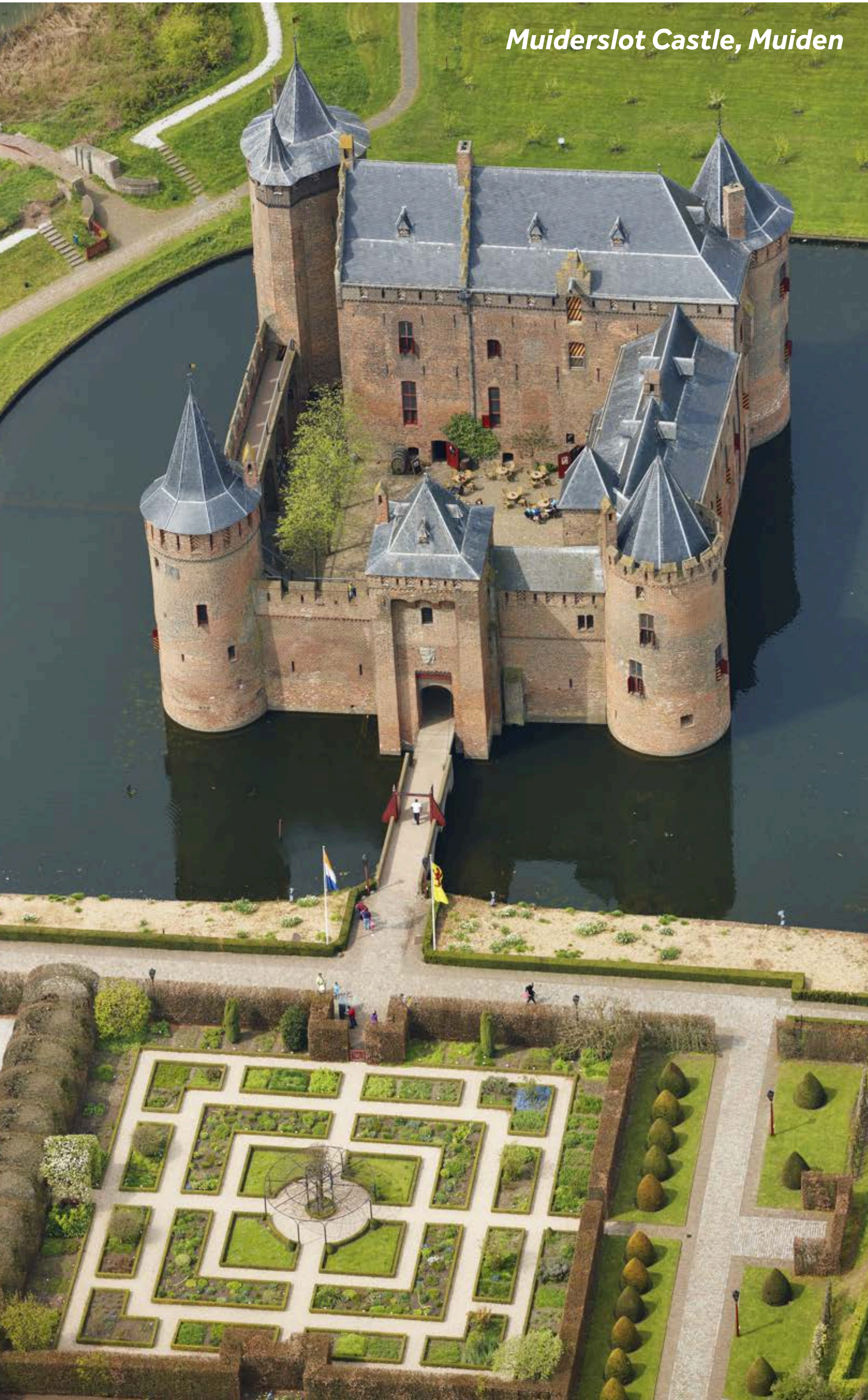
Muiderslot Castle, Muiden