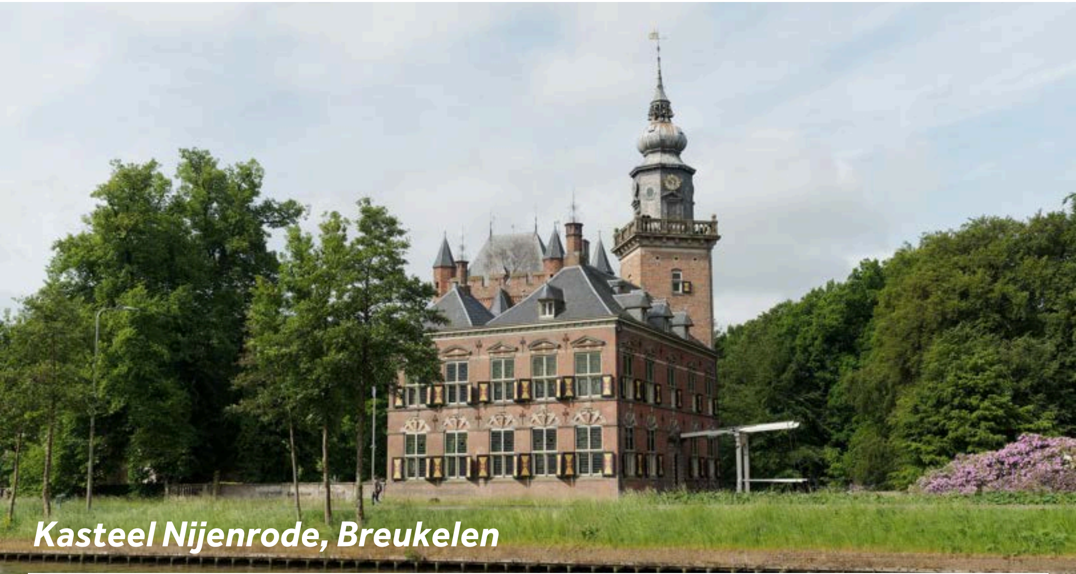
Kasteel Nijenrode, Breukelen

Breukelen is a charming town right in the heart of the Netherlands, offering a perfect blend of history, art, and relaxation. Start your day with a stroll around the beautiful Castle Gunterstein and its serene park, the castle's historic grounds are the perfect place to unwind. Don't miss a visit to Kasteel Nijenrode, a stunning castle with rich history, now home to a business university, where you can explore its grounds and learn about its past. For some culture, head to Galerie Peter Leen XL, where contemporary works showcase local talent. Finish your day with a relaxing evening at Wine Bar 't Stichtse Pakhuis, a cozy spot offering an excellent selection of wines in a charming, intimate setting.