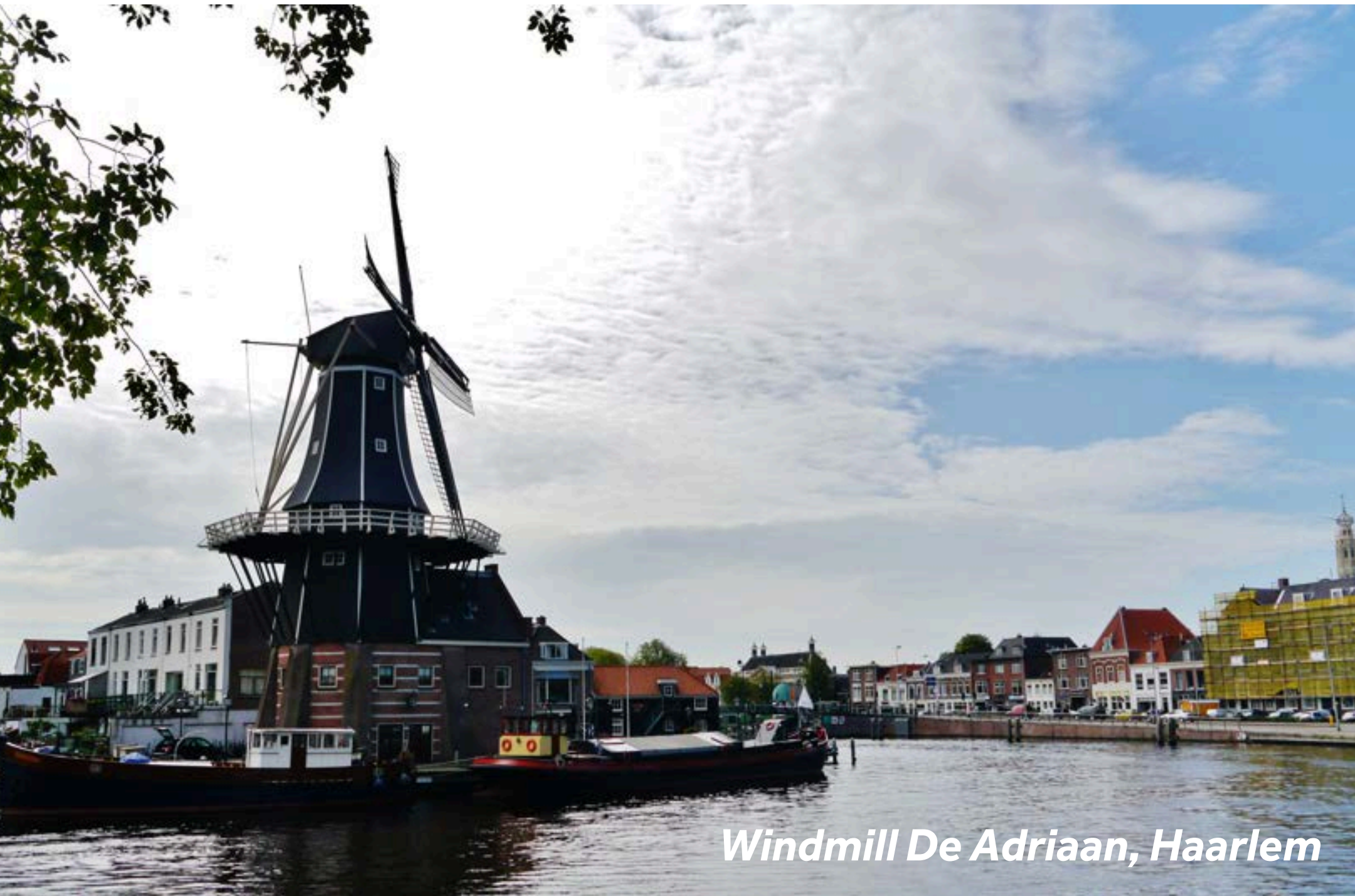
Windmill De Adriaan, Haarlem

Plan your personalized walking or biking route through Haarlem on Visithaarlem.com/en/wandel-en-fietsroutes/ .