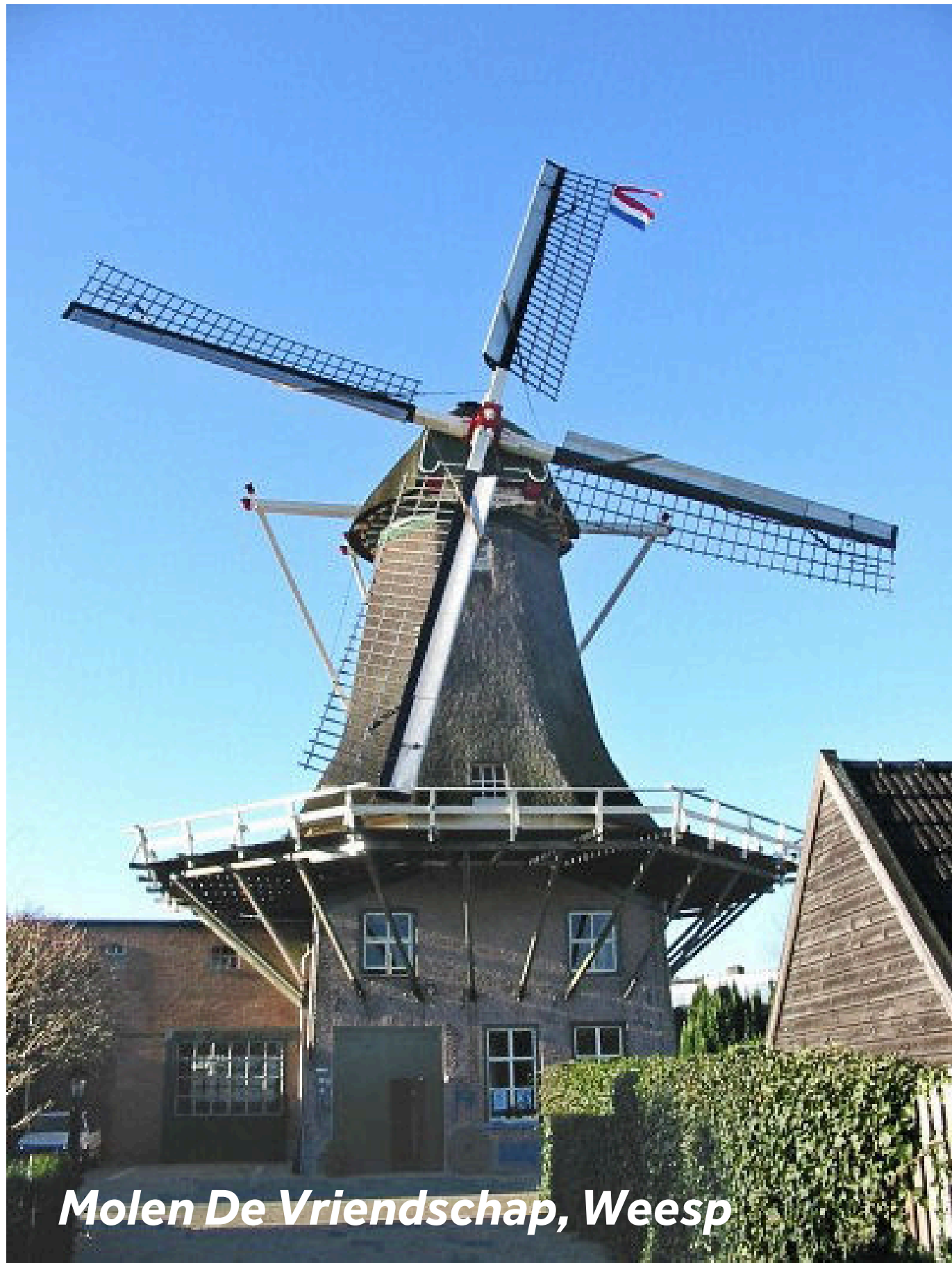
Molen De Vriendschap, Weesp

Weesp has a wealth of historic streets and attractions (stop by the tourist office for a walking map) and is famous for the having the first Dutch porcelain produced in the town, back in 1759. Nowadays, the town is renowned for Van Houten chocolate, whose factory was based in the town until 1970. The Town Hall museum “Stadhuis” now houses exhibits