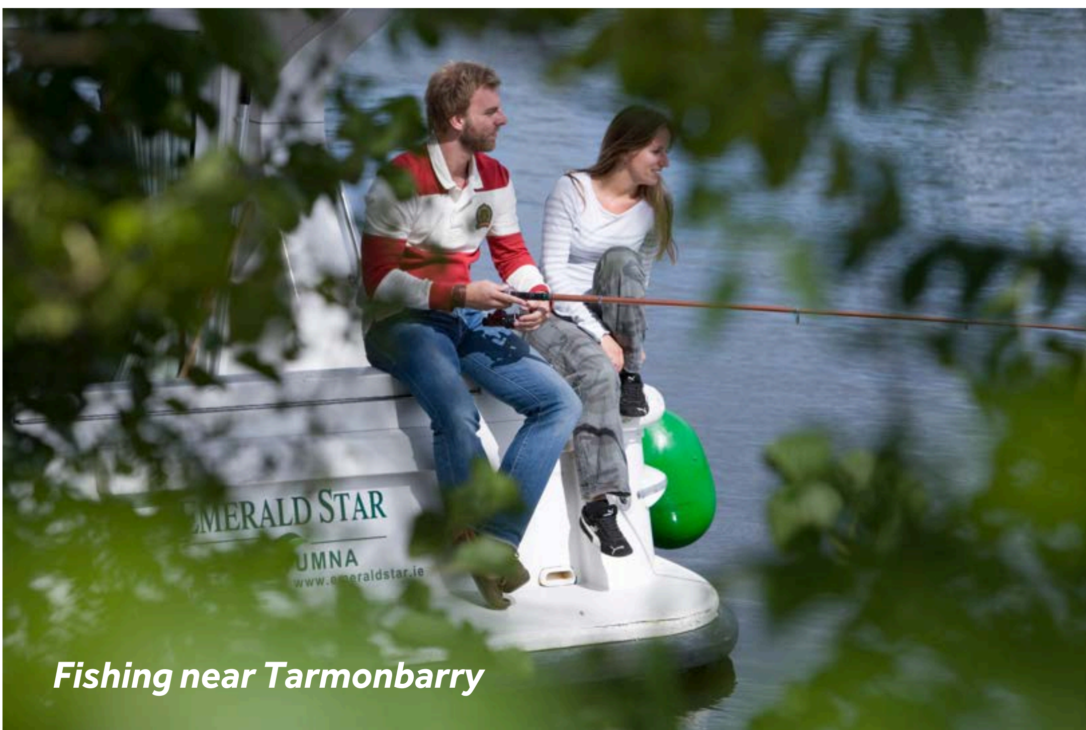
Fishing near Tarmonbarry