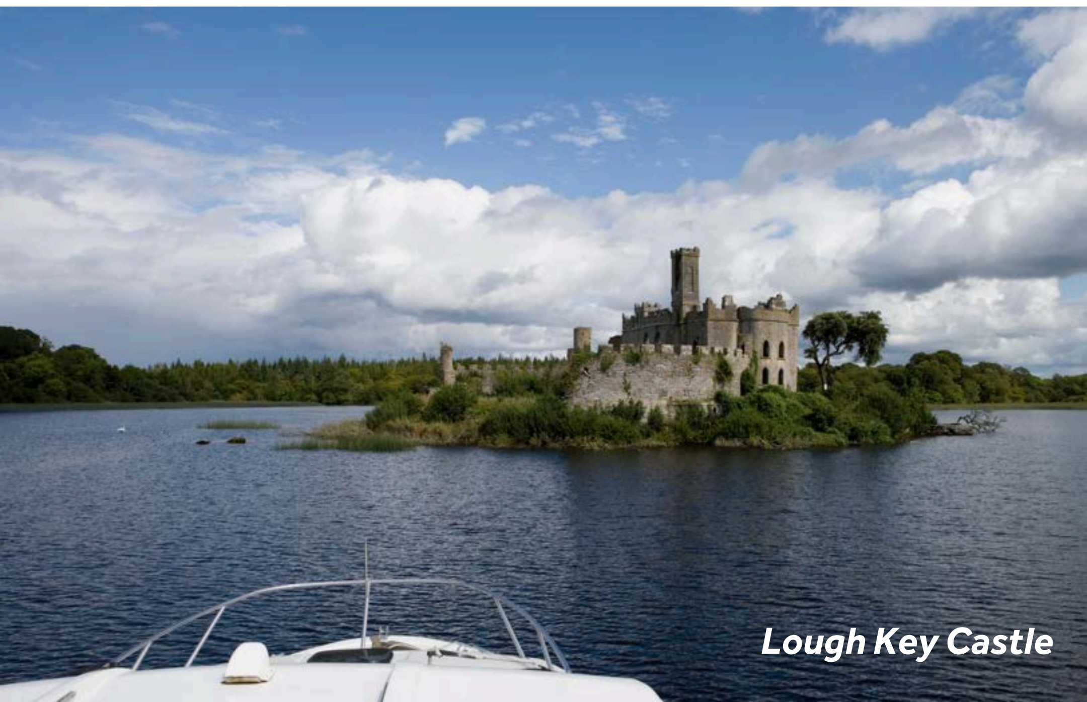
Lough Key Castle