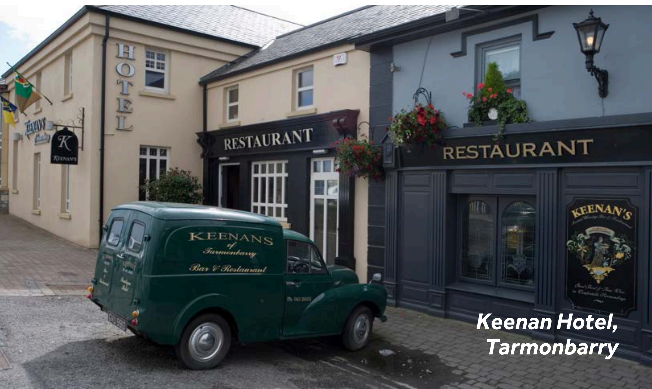
Keenan Hotel, Tarmonbarry