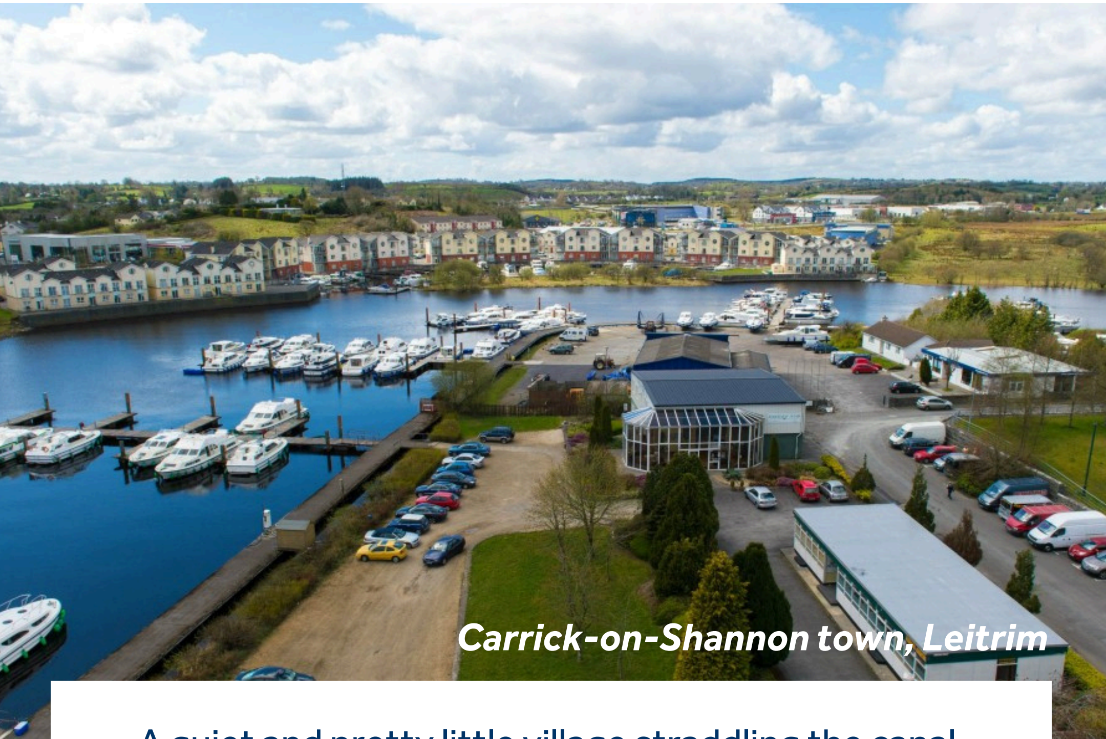
Carrick-on-Shannon town, Leitrim

A quiet and pretty little village straddling the canal, Leitrim is a great place for scenic walks or countryside bike rides. The village lies in the heart of the Blueway and has a variety of nature trails for walking enthusiasts, and the area is full of forests and lakes. Archery lanes and an electric bike hire scheme are also available.