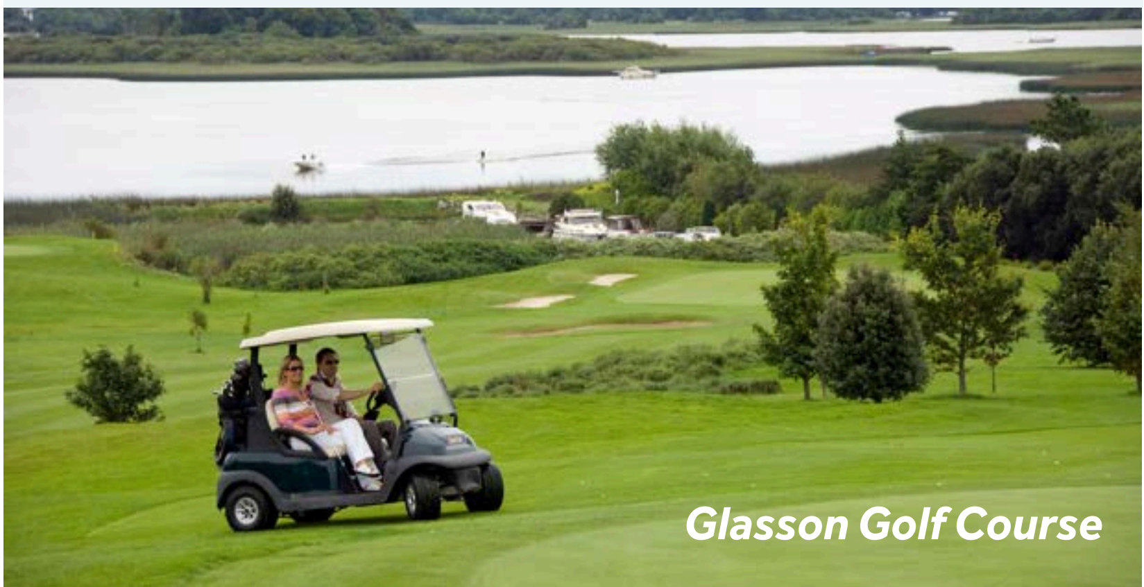
Glasson Golf Course