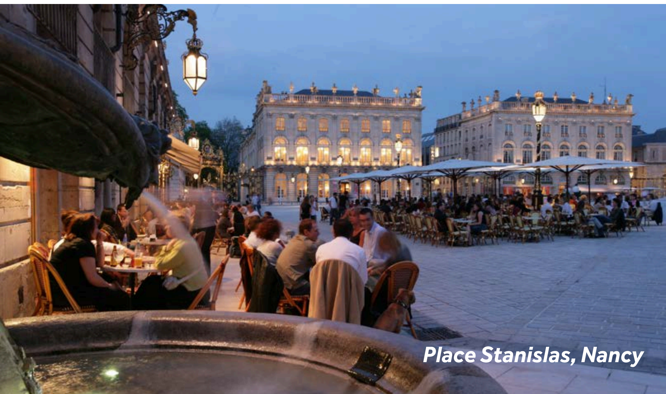
Place Stanislas, Nancy