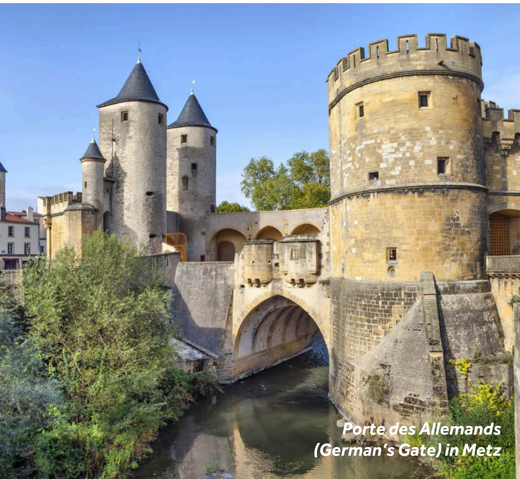
Porte des Allemands (German's Gate) in Metz