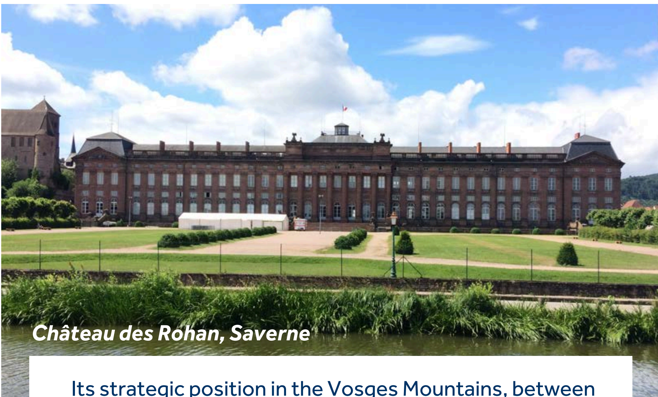
Château des Rohan, Saverne

Its strategic position in the Vosges Mountains, between the Lorraine Plateau and the Alsace Plain, makes Saverne an exceptional site. The approach to Saverne by boat is superb as you moor in front of the 'Château des Rohans' Castle. It is a typical Alsatian town with fine cuisine and beautiful shops and has kept many traces of its past, such as fortifications, a roman church, cloisters, and the pedestrian street has lovely half-timbered houses. The Rose Garden, created in 1898 (with approx. 8500 roses) is also a 'must-see' – especially in June for its rose festival.