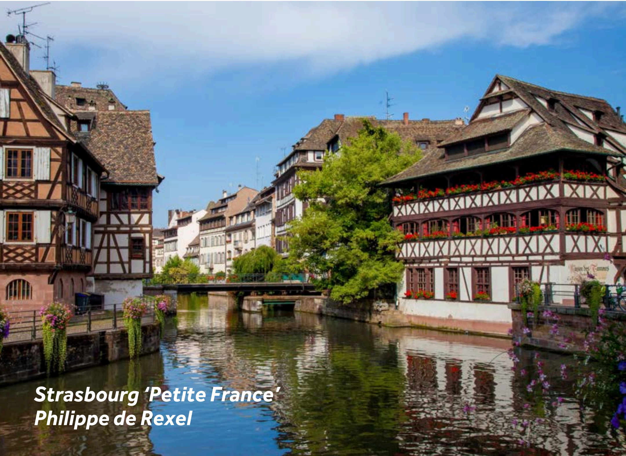
Strasbourg 'Petite France'

There are so many things to see in the Alsatian Capital, with its streets and timbered-houses bursting with flowers!