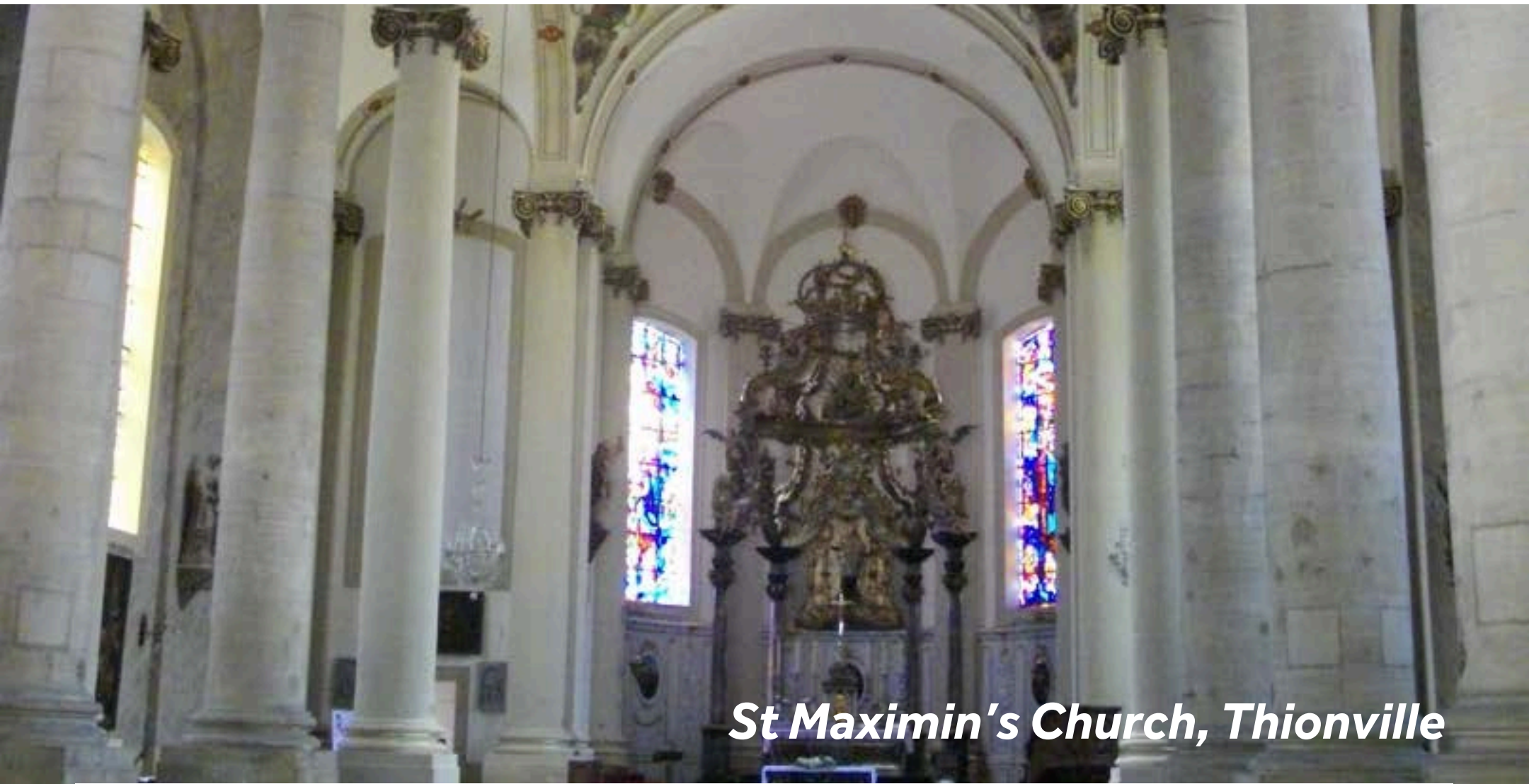
St Maximin's Church, Thionville

A historic fortified town which, although is now largely industrialised, possesses some interesting sites worth visiting. The immense and sturdy St Maximin's Church contains some very large organs, the cases of which are brimming with decorative detail. Further along the riverside, the 12th/13th century Tower of Puces is a complex fourteen-sided building which now houses the Thionville Regional Museum and charts the history of the area, from the Palaeolithic to the Late Middle Ages, including the countless sieges the town has endured over the centuries. Slightly outside of town, you can visit Guentrange Fort, fortifications built by the German army before WWI when this region was a part of Germany.